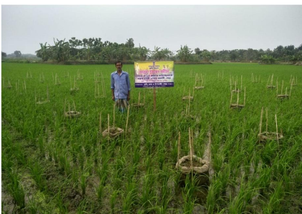
Multi crops with SRI Cultivation at Santalia village of Islampur block