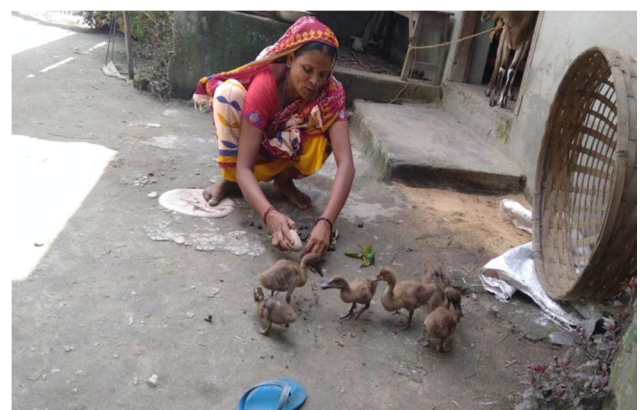
Khaki Campbell duckling was given to Women farmers at Santalia village of Islampur block