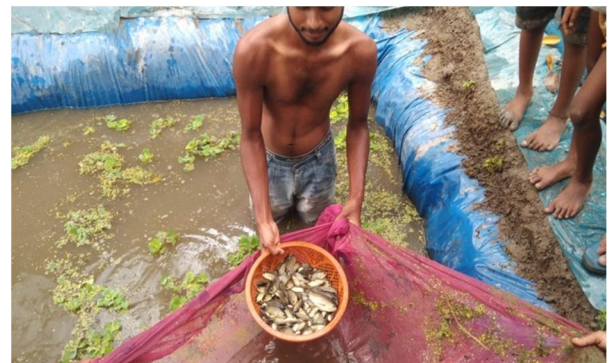
Bio flock fish (Koi) farming at of Islampur block