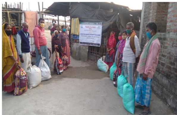
Dry ration kit distributed among the community people for DFW work at Ramgani of Islampur