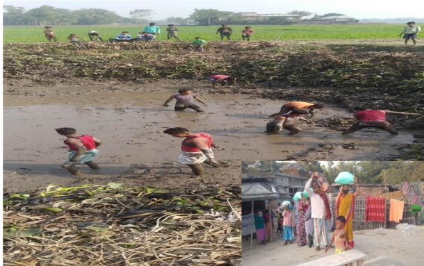
Community Pond cleaning at Ramganj of Islampur Block of Uttar Dinaipur under DFW work

This year the organisation organized Cloth for Work programme with the support from GOONJ. Under this programme the organisation undertaken various rural development programme like : Kaccha Road repairing, Pond excavation, Kitchen Garden Programme, Cleaning Pond, Band Stand, Building Tribal Community Hall etc. The organisation provided dry ration or cloths in lieu of their effort.