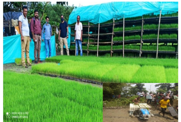
Paddy sapling Seed bed for Paddy Transplantation at Ruhia Village of Islampur Block

Under this programme Uttar Dinajpur Krishi Vigyan Kendra, Chopra, is extending their support towards better implementation of the project and DDM, NABARD, Uttar Dinajpur, Assistant Director of Agriculture, and Assistant Director-Agricultural Marketing U/D. and Other Line Departments are also helping the organisation to achieve the Goal of the Project.