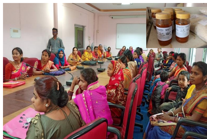
Food processing Training at Krishi Bigyan Kendra – Chopra supported by NABARD