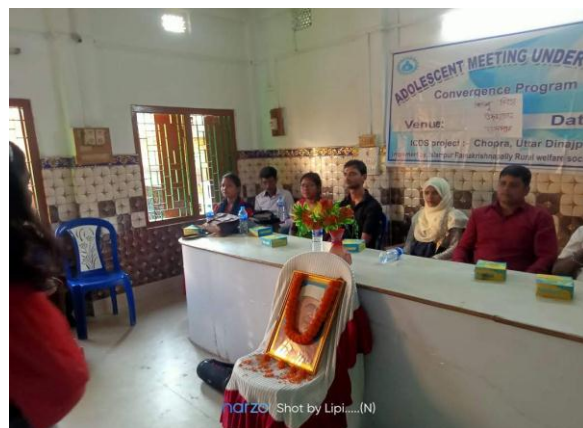
SAG – Kanyashree Convergence Meeting at Chopra