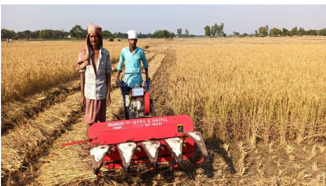
Firm Mechanisation : farmer of Balancha using Paddy Reaper

Under this programme Uttar Dinajpur Krishi Vigyan Kendra, Chopra, is extending their support towards better implementation of the project and DDM, NABARD, Uttar Dinajpur, Assistant Director of Agriculture, and Assistant Director-Agricultural Marketing U/D. and Other Line Departments are also helping the organisation to achieve the Goal of the Project.