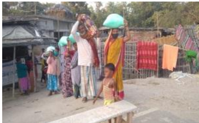
Dry ration kit distributed among the community people for DFW work at Ramganj of Islampur Block of Uttar Dinainur under DFW work