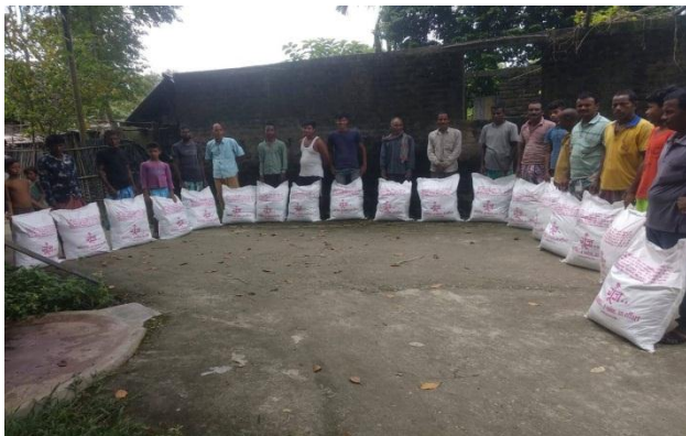
DFW kit were distributed among the Community for Kaccha Road repairing at Bansbari Village of Islampur Block of Uttar Dinainur

This year the organisation organized Cloth for Work programme which is now named as “Dignity for Work (DFW)” with the support from GOONJ. Under this programme the organisation undertaken various rural development programme like : Kaccha Road repairing, Pond excavation, Kitchen Garden Programme, Cleaning Pond, Band Stand, Building Tribal Community Hall etc. The organisation provided dry ration or cloths in lieu of their effort.