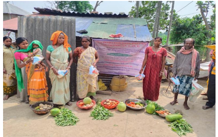
Distributing Health Kits and Vegetable to the needy migrant worker.