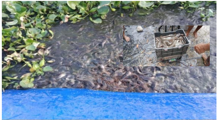
Bio Flock fish farming unit at Balancha Village