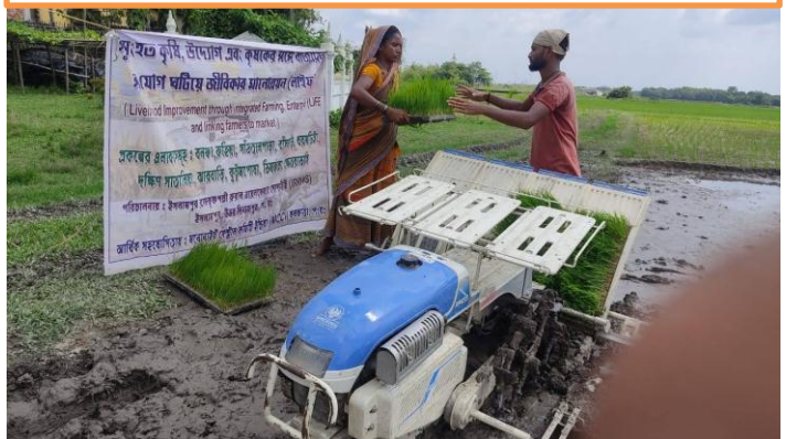
Paddy seedlings being transplanted by Paddy Transplanter machine by IRRWS at Ruhia Village of Islampur Block

Under this programme Uttar Dinajpur Krishi Vigyan Kendra, Chopra, is extending their support towards better implementation of the project and DDM, NABARD, Uttar Dinajpur, Assistant Director of Agriculture, and Assistant Director-Agricultural Marketing U/D. and Other Line Departments are also helping the organisation to achieve the Goal of the Project.