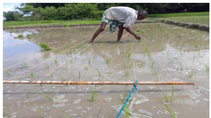
SRI Cultivation of Rice : Md Anikul transplanting Paddy using rural Technique