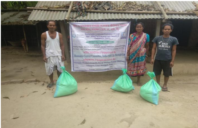
Distributing Dry Ration Kits among the migrant labours.