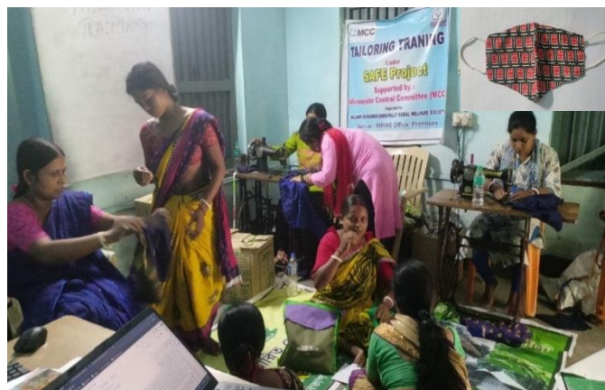
SHGs women are preparing Mask, Pant, Frock etc during the Tailoring training.